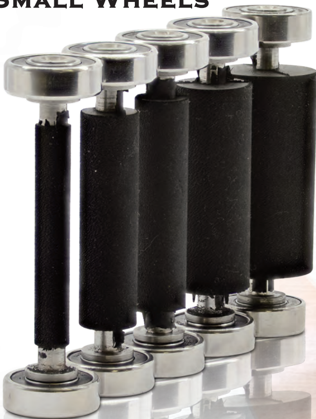
SIZES FROM 5/16" TO 1"

UPGRADE YOUR OLD 965 TO THE NEWEST VERSION! 965RETRO KIT CONTAINS 9660, 9657, 9651 & 9655 - NO WHEELS INCLUDED